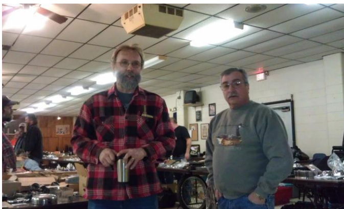
Pictures from the ABATE swap meet in Rock Falls on Sunday the 8 th . The meet was small but the weather was great and there were a lot of CBC members there to enjoy the fellowship.