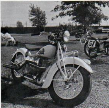
Beautifully restored 1936 Indian Four belonging to Louis Baettry