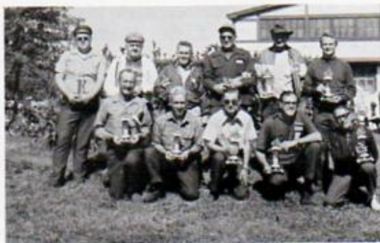
The winners of all classes taken right after the awarding of the trophies